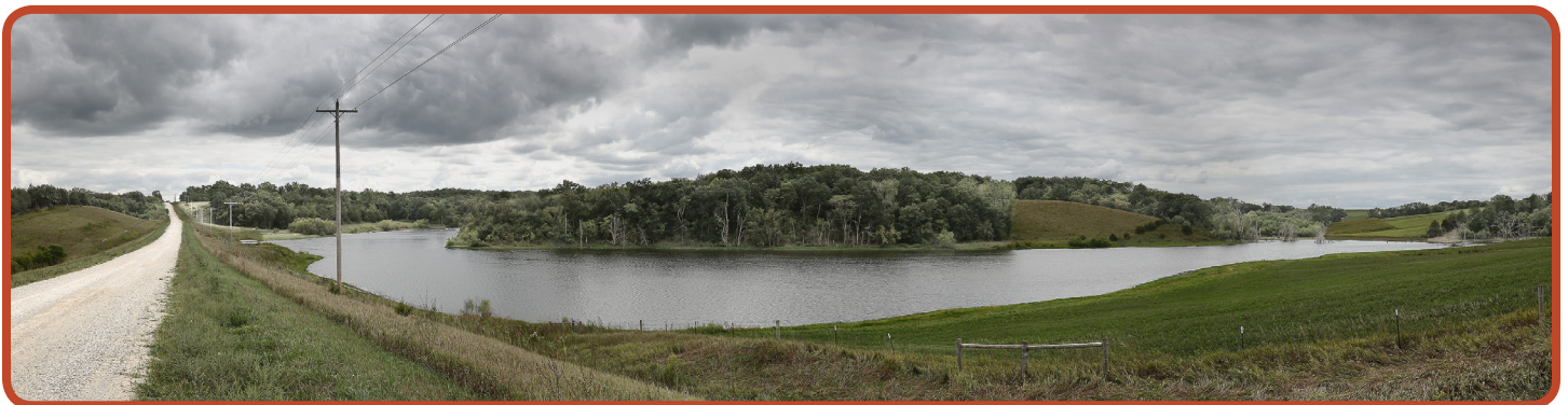
Located on Fir Avenue in Davis County in the Soap Creek Watershed, this IWP structure replaced an existing box culvert. It controls a drainage area of 1,150 acres and has a permanent pool of 20.5 acres.